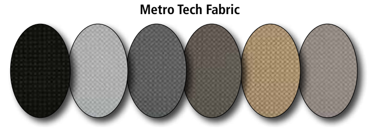
See material swatches for accurate color representation.