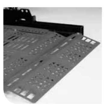
Self-leveling platform with traction coating.