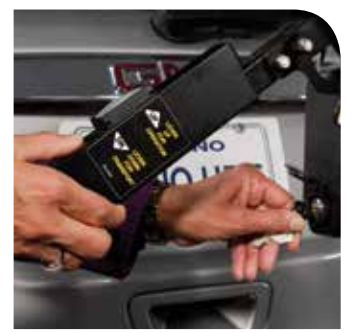
One-button operation with built-in safety latch to prevent unintentional platform lowering.