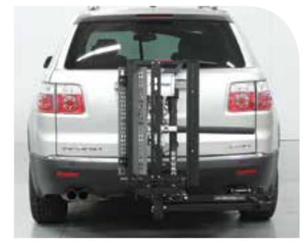
HTP Mid Wheel Drive (MWD) accommodates MWD powerchairs with 10 in and 14 in wheels.