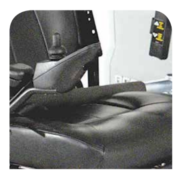
Hold-Tite arm securement for powerchairs.