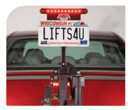
Low-profile third brake light.

• Vinyl cover (not shown) • Mid Wheel Drive (MWD) platform