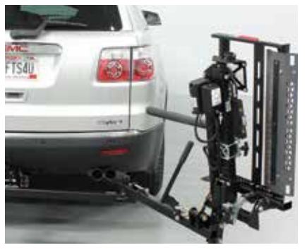
Swing-Away: Easy access to hatch/cargo space.